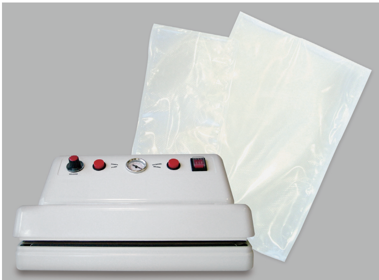
Residential Vacuum Packaging Machine with Analog Control and Embossed Bags

Ideal for high demand residential and light duty commercial applications. The strong pump and professional seal ensure a long storage life for the packaged products. Sealing is electronically timed and is adjustable. The body is constructed of high-density plastic for easy cleaning. Embossed bags to be used with this unit.