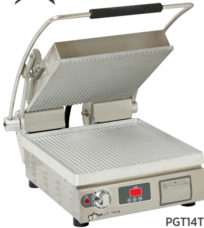
PGT14T [new models will utilize a different label design]