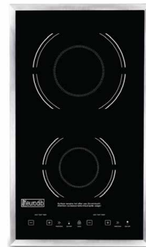
2800W (front: 1000W, back: 1800W)