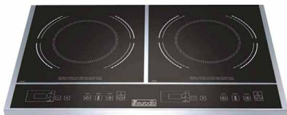
Shared power - will not reach maximum power (1800W) on both sides.