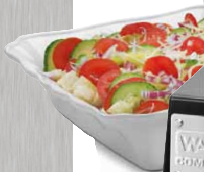
3.5Qt Pro Food Processor