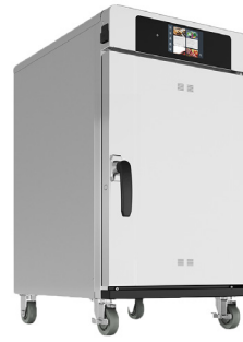
Shown with Deluxe control