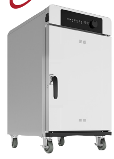
Shown with Simple control