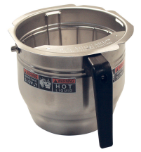
FUNNEL AY,W/DECAL GRT "C"7.12