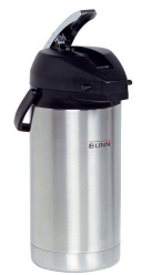
AIRPOT, 3.8L SST LA SINGLE PK