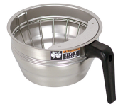
FUNNEL ASSY, SST-BLK HDL(7.12)