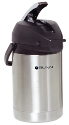
AIRPOT, 2.5L SST LA SINGLE PK