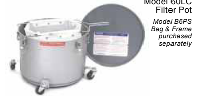
Model 60LC Filter Pot Model B6PS Bag & Frame purchased separately

For filtering and safer handling of hot oil Low profile to fit under drain valves