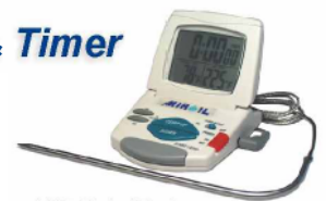
MTT Digital Frying Thermometer & Timer