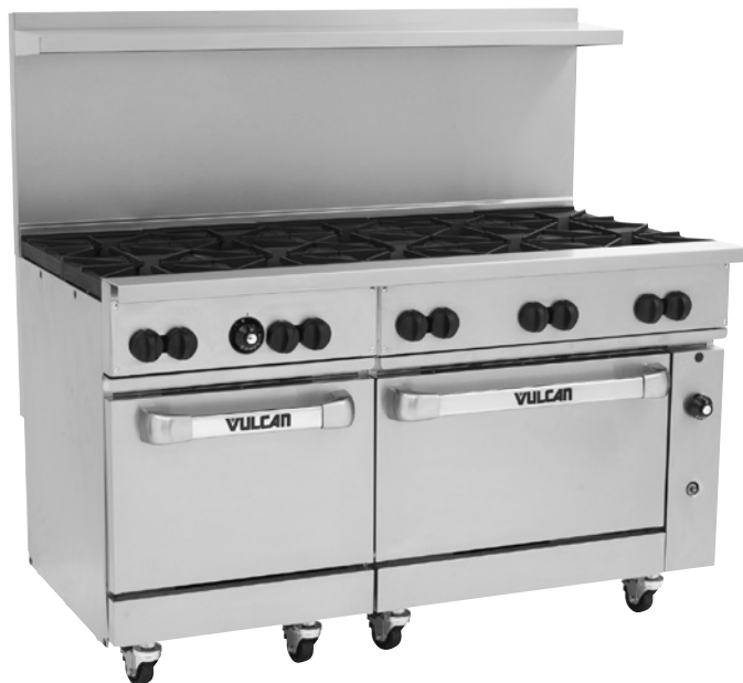
Model 60SS-10BN (shown with optional casters)