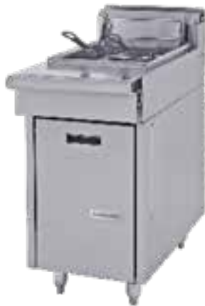
Model C836-1-35 Range Match Gas Fryer