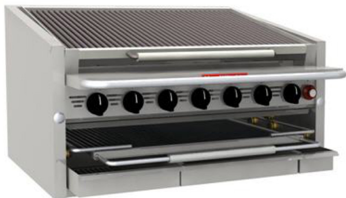
Unit shown with optional lower rack