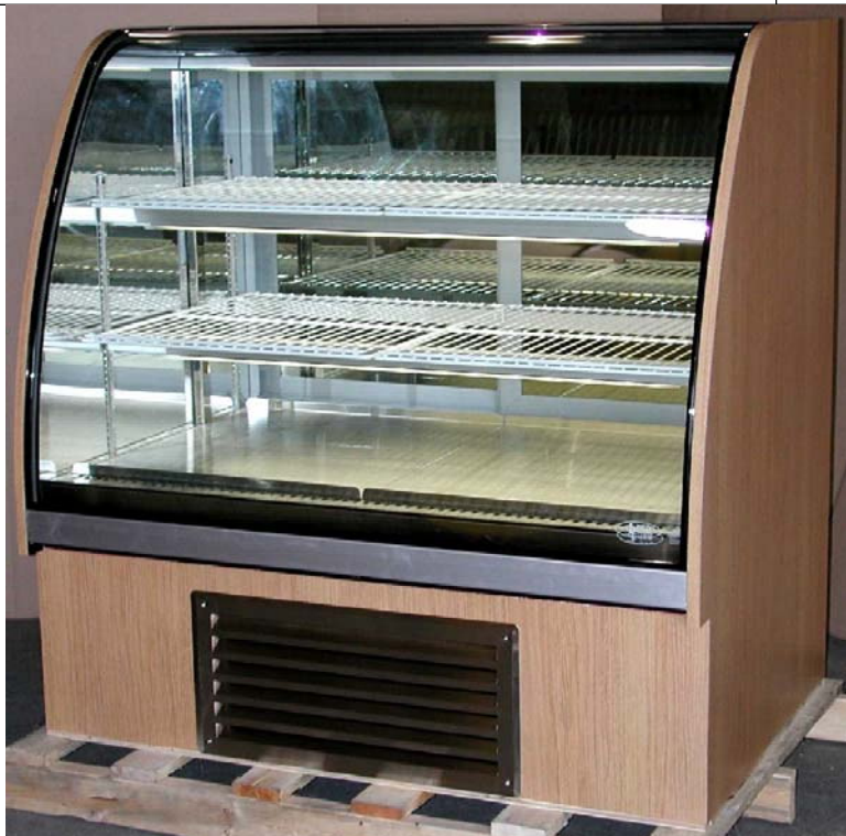
Manufacturers of food service displays

**QBD WARRANTY DOES NOT INCLUDE PRODUCT LOSS OR CONSEQUENTIAL DAMAGES HOWEVER CAUSED.