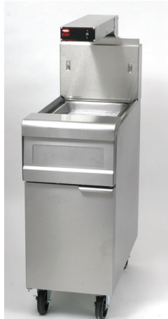
Spreader Cabinet with optional Food Warmer, holding station with cafeteria pan and casters. .

Food warmer and holding station with scoop-type pan.