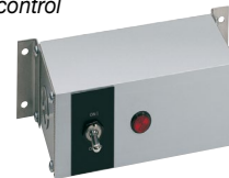
RMB-3F with toggle switch and indicator light