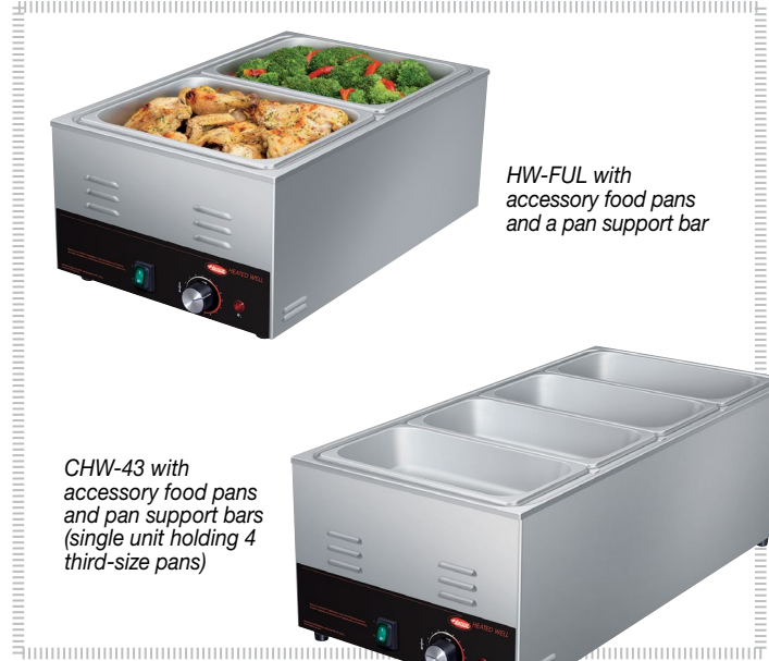
HW-FUL with accessory food pans and a pan support bar