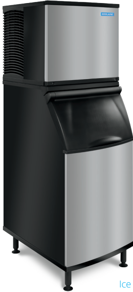
Koolaire KT-0420 Ice Kube Machine on K420 Bin

Koolaire by Manitowoc ice machines are designed, developed and tested by Manitowoc engineers to provide great ice production, energy efficiency and reliable service at an affordable price.