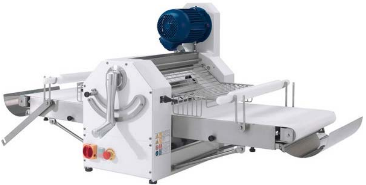
Reversible Dough Sheeter, Bench Model, 20 Speeds, 19 11/16" Stainless Steel Rollers, Adjustable Roller Gap (1-40mm), Enamel Coating, 1 HP, CE & ETL Listed