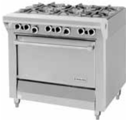
Model M43R Range With Six Open Star Burners