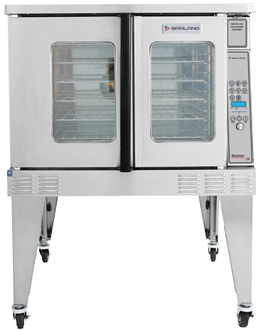
Model MCO-ES-10 Shown with optional casters