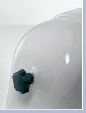
Cut thickness adjusting knob