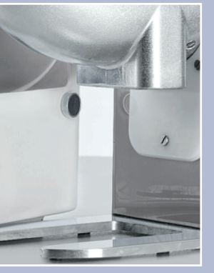
Collecting tray with