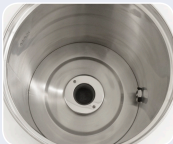
Stainless Steel Interior