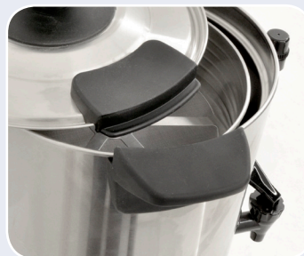
Locking Lid and Handles