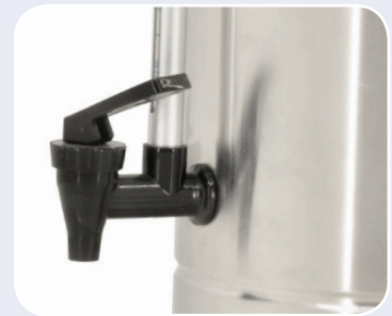
Non-Drip Water Faucet