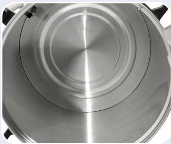
Stainless Steel Interior