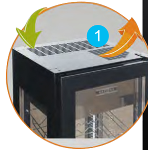
Cold and hot air exchange on top