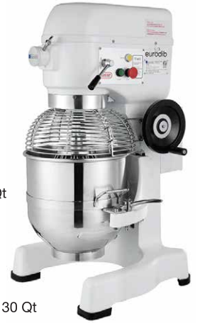
M30 ETL220 - 30 Qt