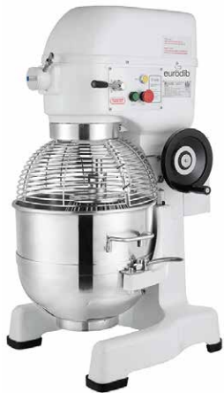
M40A 220ETL - 40 Qt