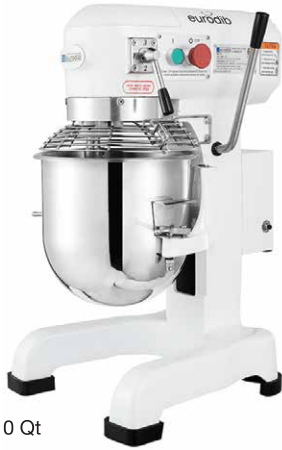
M10 ETL - 10 Qt

★ M10 ETL, M20 ETL and M30 ETL are NOT SUITABLE for pizza, pita or bread dough. Stop the machine to change speed. Do not mix dough at middle or high speed.