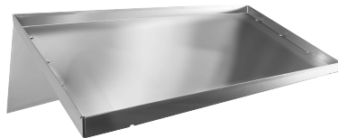
Universal Slant Shelf 27"-42"

Temp-Sure™ heater assures a continuous supply of 140° F hot water that guarantees excellent results.