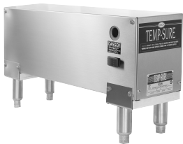
Temp-Sure (Self contained 12kW heater)

Temp-Sure™ heater assures a continuous supply of 140° F hot water that guarantees excellent results.