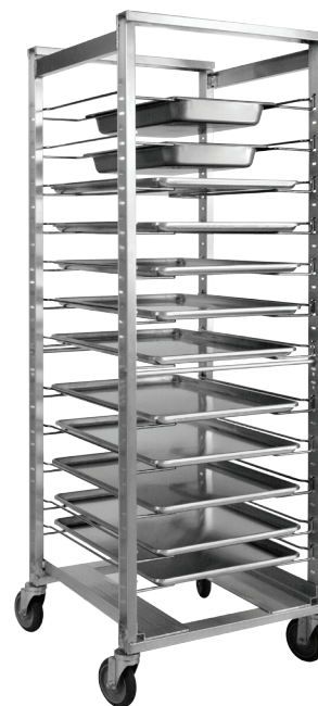
207-UA-13A (Pans not included)