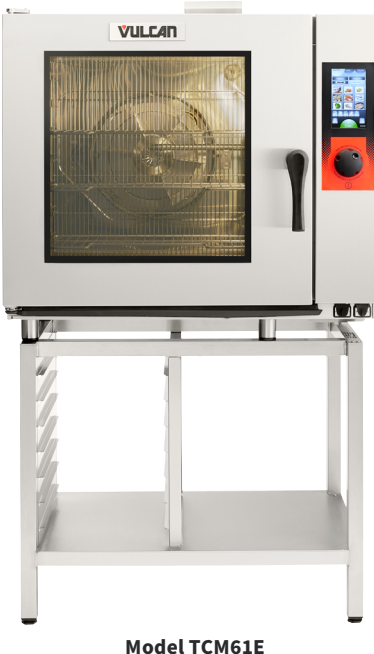
Shown on optional stand