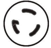
Nema L6-30 Twist