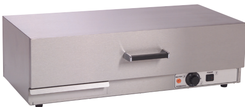
WD-35A with water tray

Ready to serve but tastes like made to order—the Warmer Drawer keeps products fresh and delicious for customers. It features a precision thermostat to adjust the temperature required for your bread product.