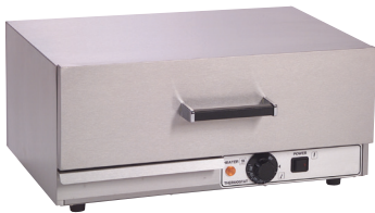
WD-20 with water tray