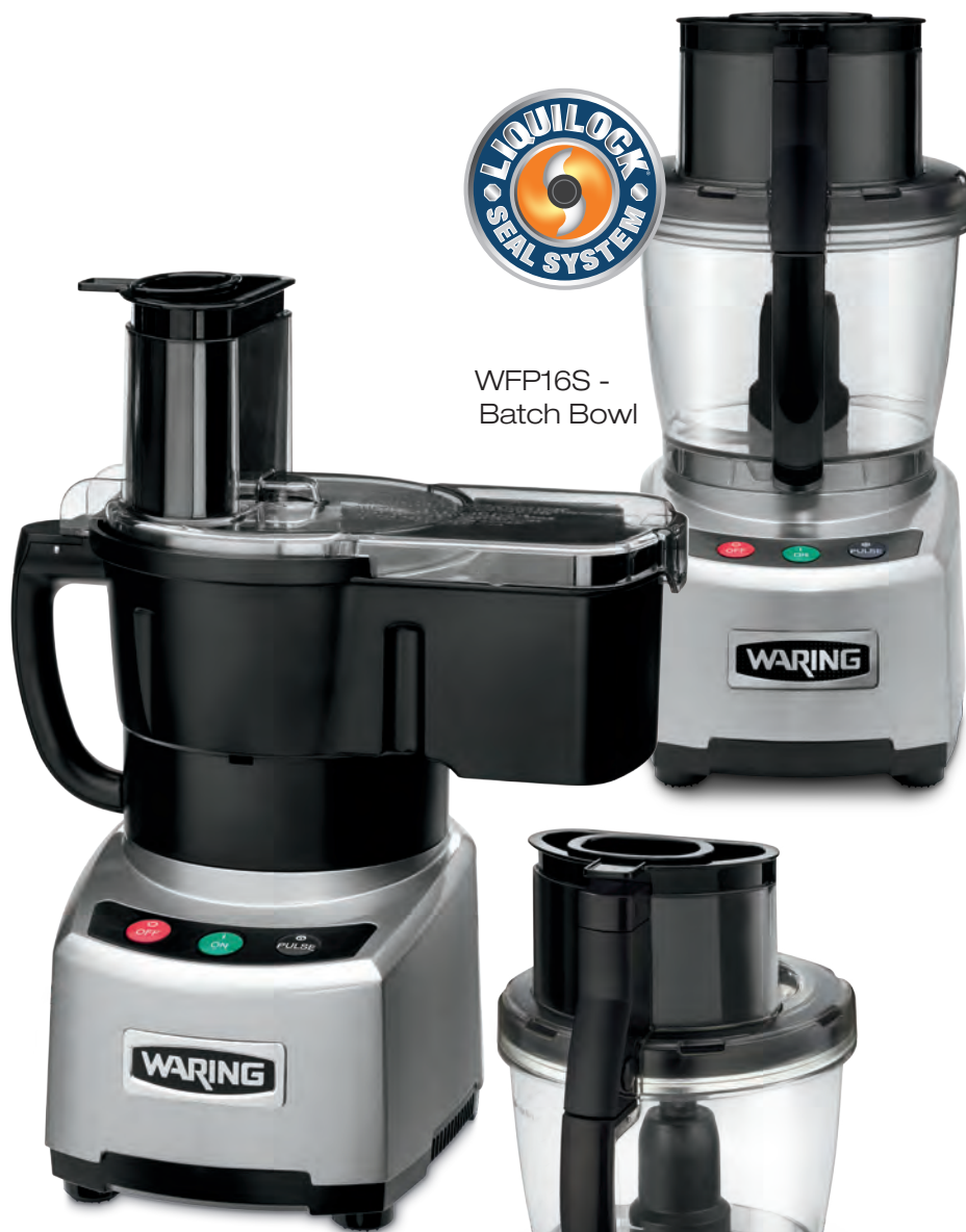
WFP16SCD - Dicing/Continuous Feed Chute and Batch Bowl