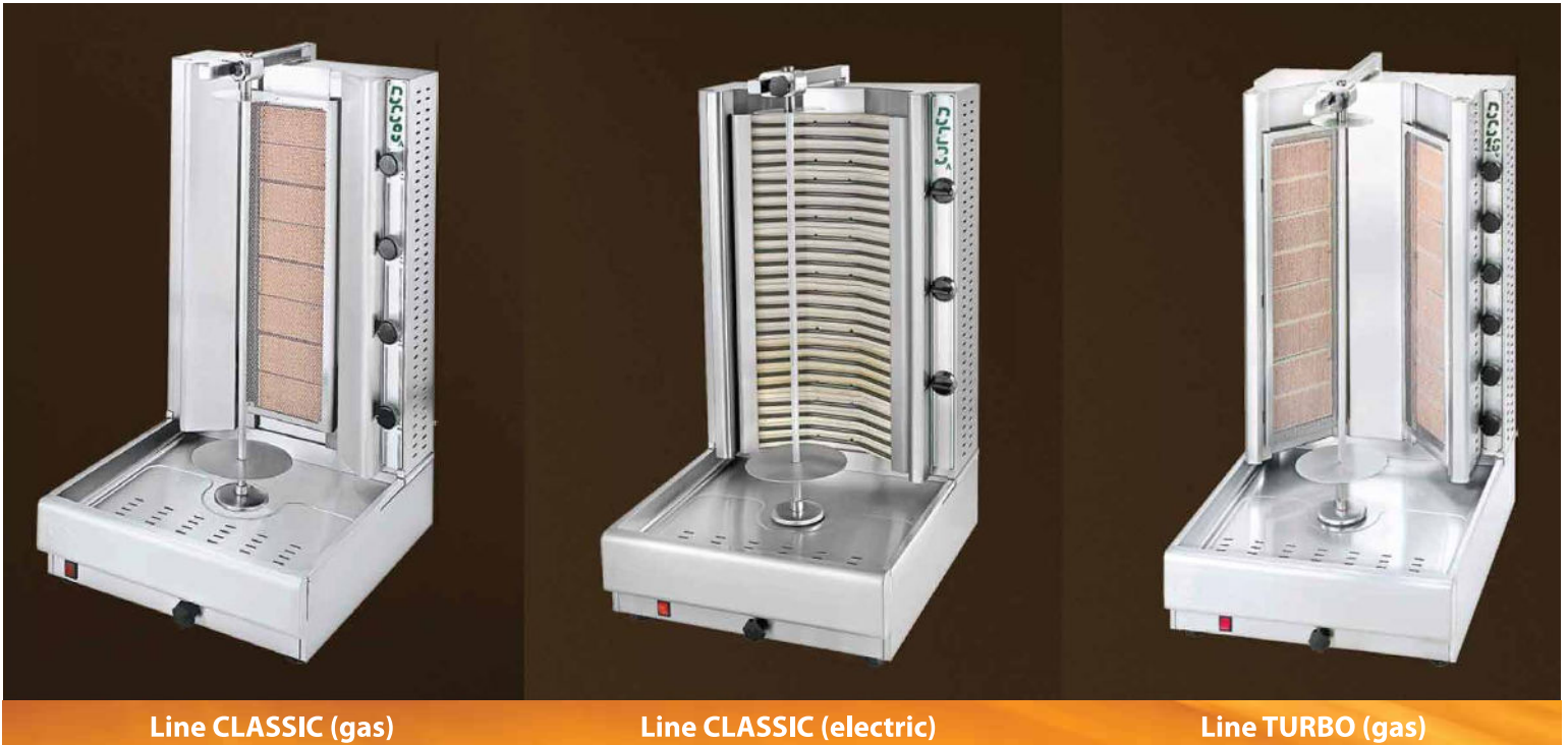
Line CLASSIC (gas)

Manufactured and imported directly from Greece, the home of the gyro!