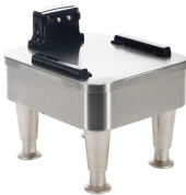
1SH STAND, 120V INF SERIES