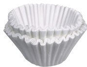
FILTERS, GOURMET 500 500/1 50/CL