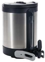
SH SERVER, 1.5G/5.7L INF SERIES