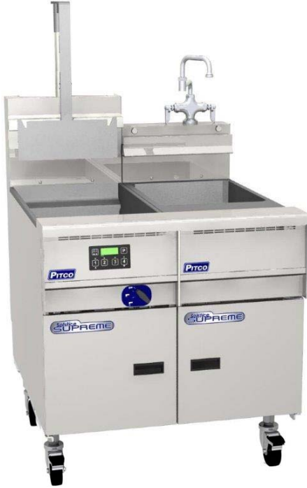
Shown with Optional Rinse Station Shown with optional: Casters, Single Basket Lift