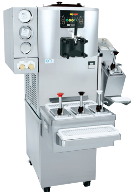
Optional cart with rear door for front mount syrup rail