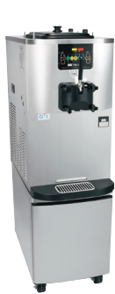
Optional cart with front opening door